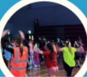
GLOW IN THE DARK