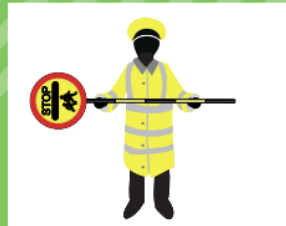
Figure B - Sign sideways - Barrier to prevent pedestrians crossing. Not ready to cross pedestrians