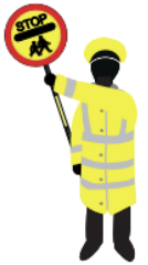
Figure C - Sign held up high - ready to cross pedestrians. Vehicles must stop unless unsafe to do so.