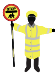
Figure D - Sign held up high - All drivers must stop

Please support your local School Crossing Patrol Service Find out more online - www.roadsafetygb.org.uk