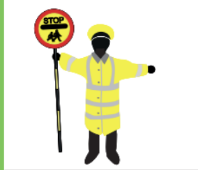
Figure D - Sign held up high - All drivers must stop

Please support your local School Crossing Patrol Service Find out more online - www.roadsafetygb.org.uk