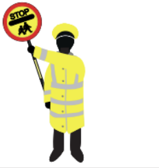
Figure C - Sign held up high - ready to cross pedestrians. Vehicles must stop unless unsafe to do so.